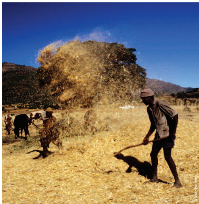
Farmers work in their Teff fields, Ethiopia.