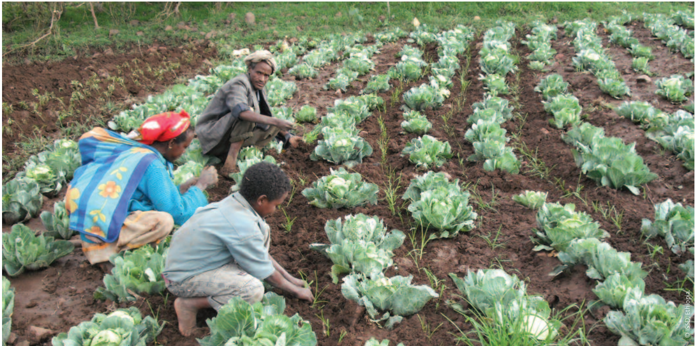
Planting finger millet between cabbages, Kewanit Ethiopia