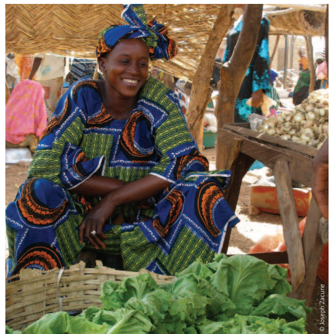
A woman at a market in Ghana.