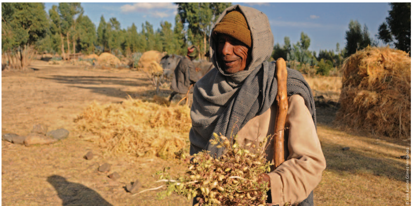
An Ethiopian farmer shows his chickpea plant harvest.

To date, only one regional harmonisation effort, undertaken by the Common Market for Eastern and Southern Africa (COMESA), has made sufficient progress toward becoming an operational reality. 70 The only other REC to have undertaken significant work on regional harmonisation is the Economic Community of West African States (ECOWAS). However, it would seem that lingering ties to the values underpinning the African Model Law on Biosafety are still creating obstacles and frustrations for donors such as USAID, and have effectively stymied the process in this region for now.