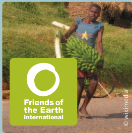
Matooke banana seller.