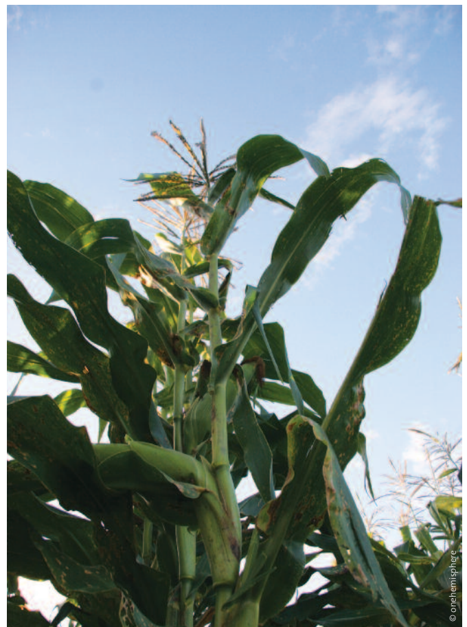
Maize growing in Lesotho.