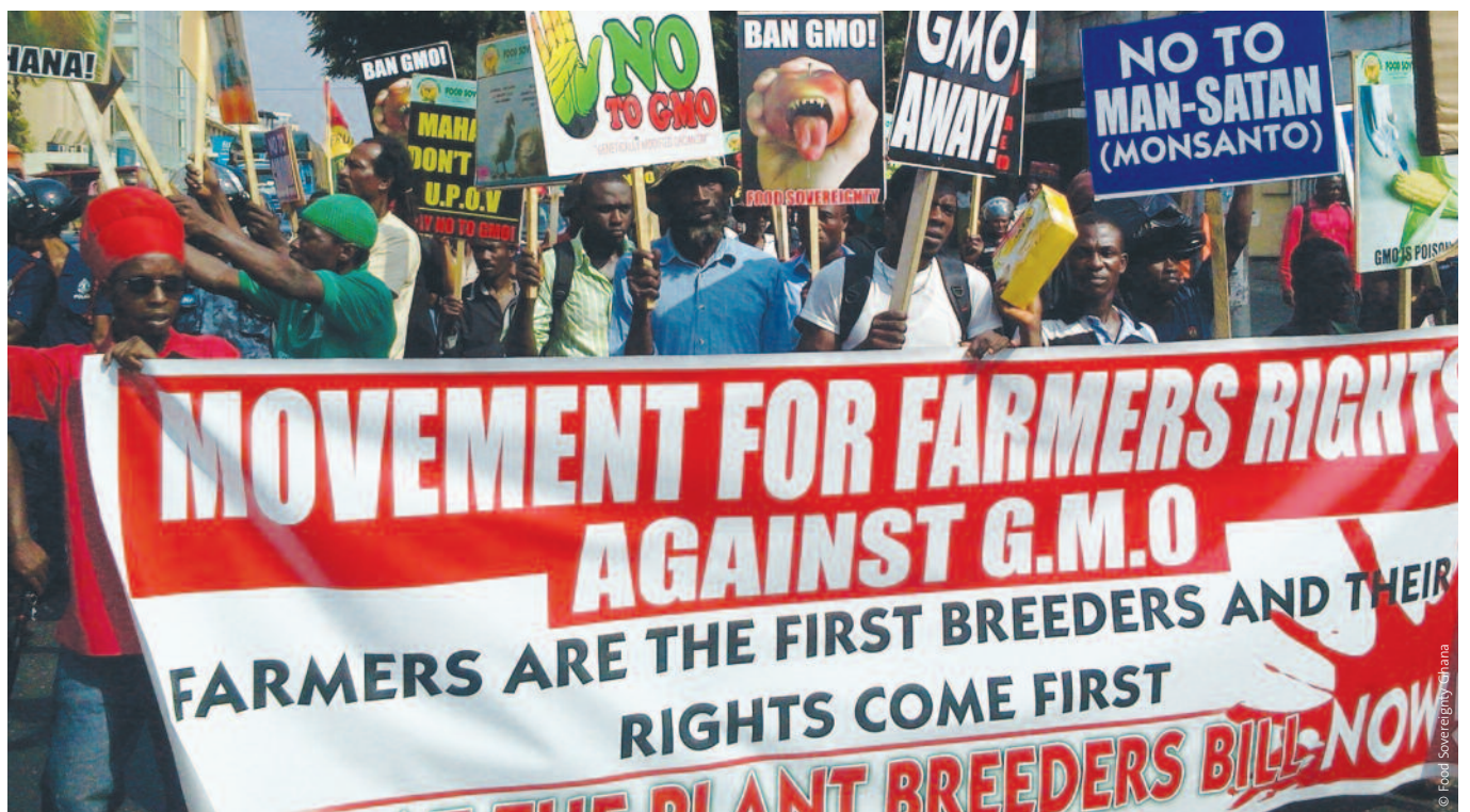
Protests in Ghana.