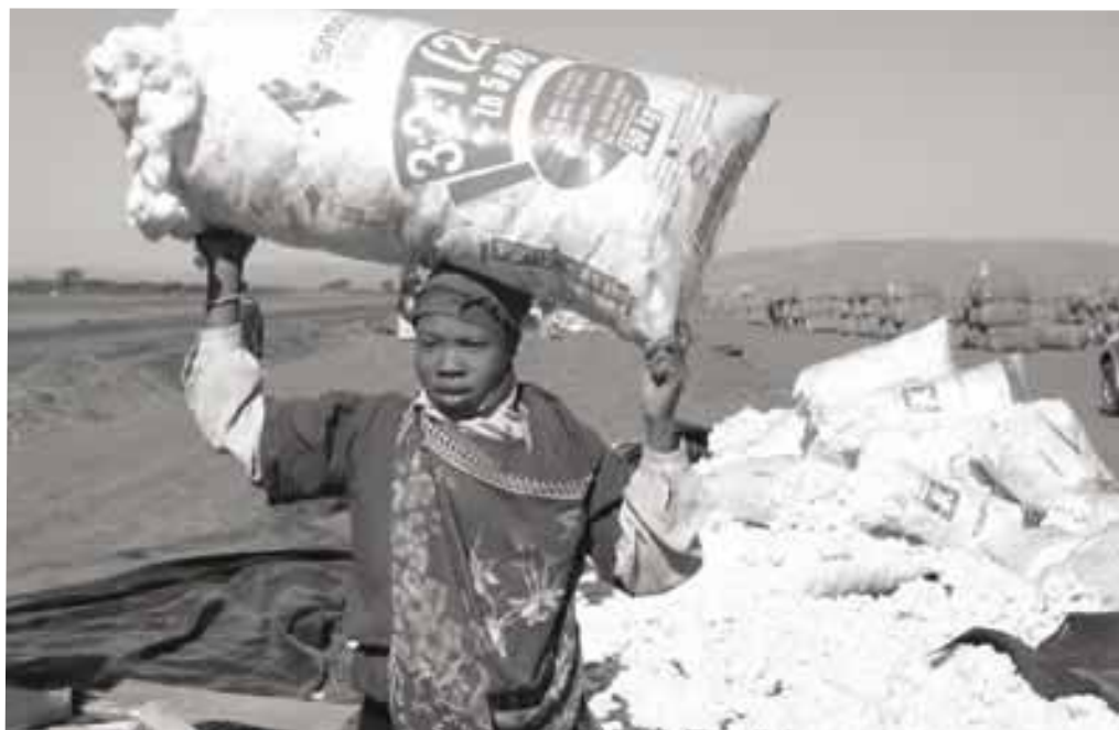
Photo: Woman hauling bagged cotton in South Africa