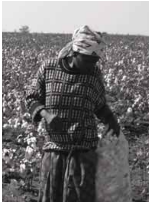
Photo: Picking cotton in South Africa