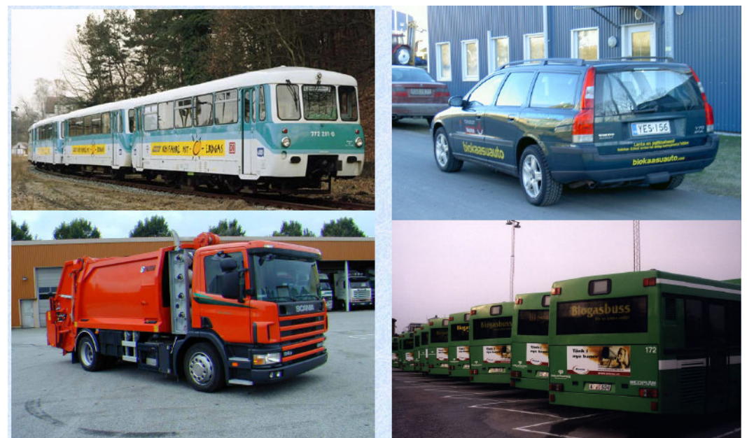
Figure 2: Various Biogas Powered Vehicles

Biogas can be produced with the existing kraaled animal manure using cheap polyethylene tube digesters. Furthermore the use of biogas as a vehicle fuel is a mature technology and there are over five million flexi fuel cars that can be powered by biogas on the planet. The Department of Science and Technology prefeasibility study report entitled ' Preparatory Framework for a National Biogas Programme '<sup>12</sup> clearly indicates the feasibility of rolling out biogas systems in the rural communities to provide access to clean, safe energy & appropriate sanitation.